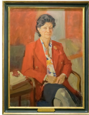
Dame Fiona Caldicott