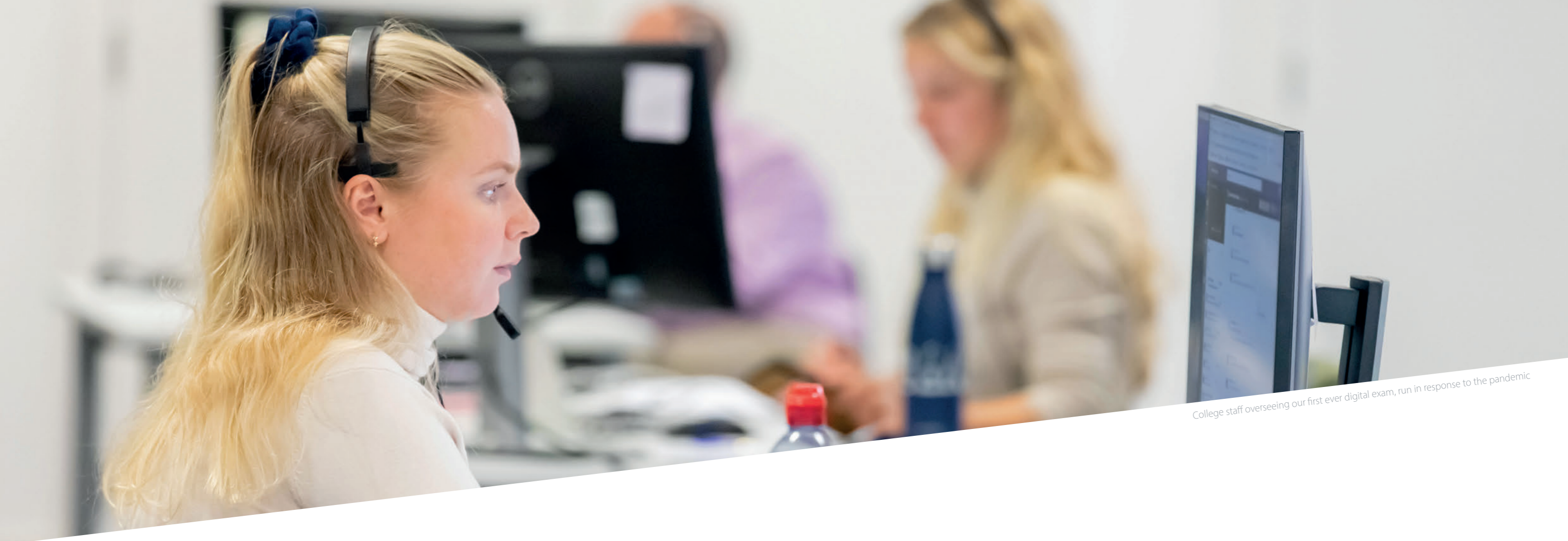
College staff overseeing our first ever digital exam, run in response to the pandemic