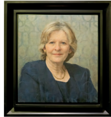
Baroness Sheila Hollins