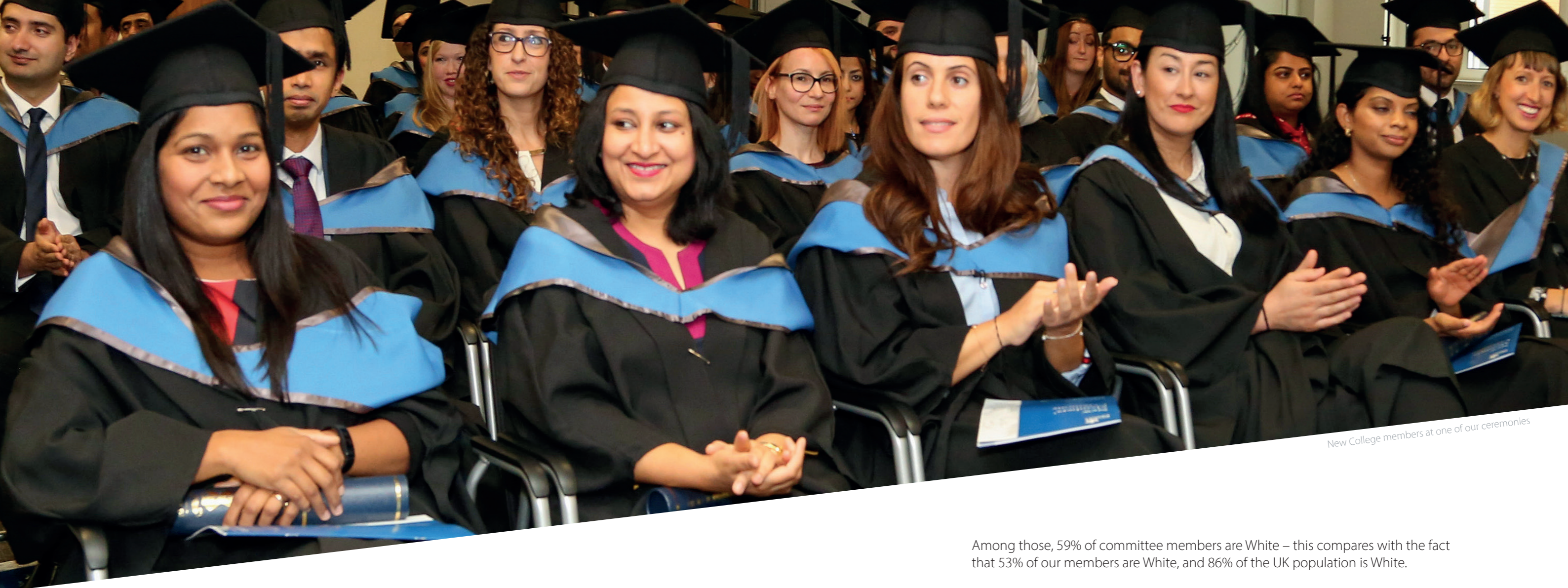
New College members at one of our ceremonies