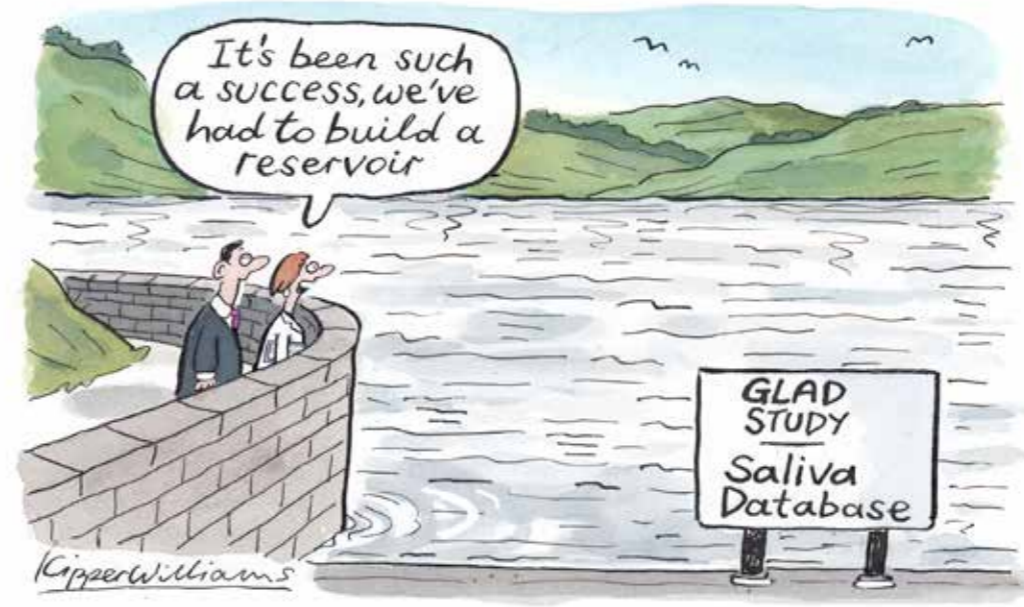
Find out about how the GLAD (Genetic Links to Anxiety and Depression) study is using saliva samples to understand anxiety and depression on p20