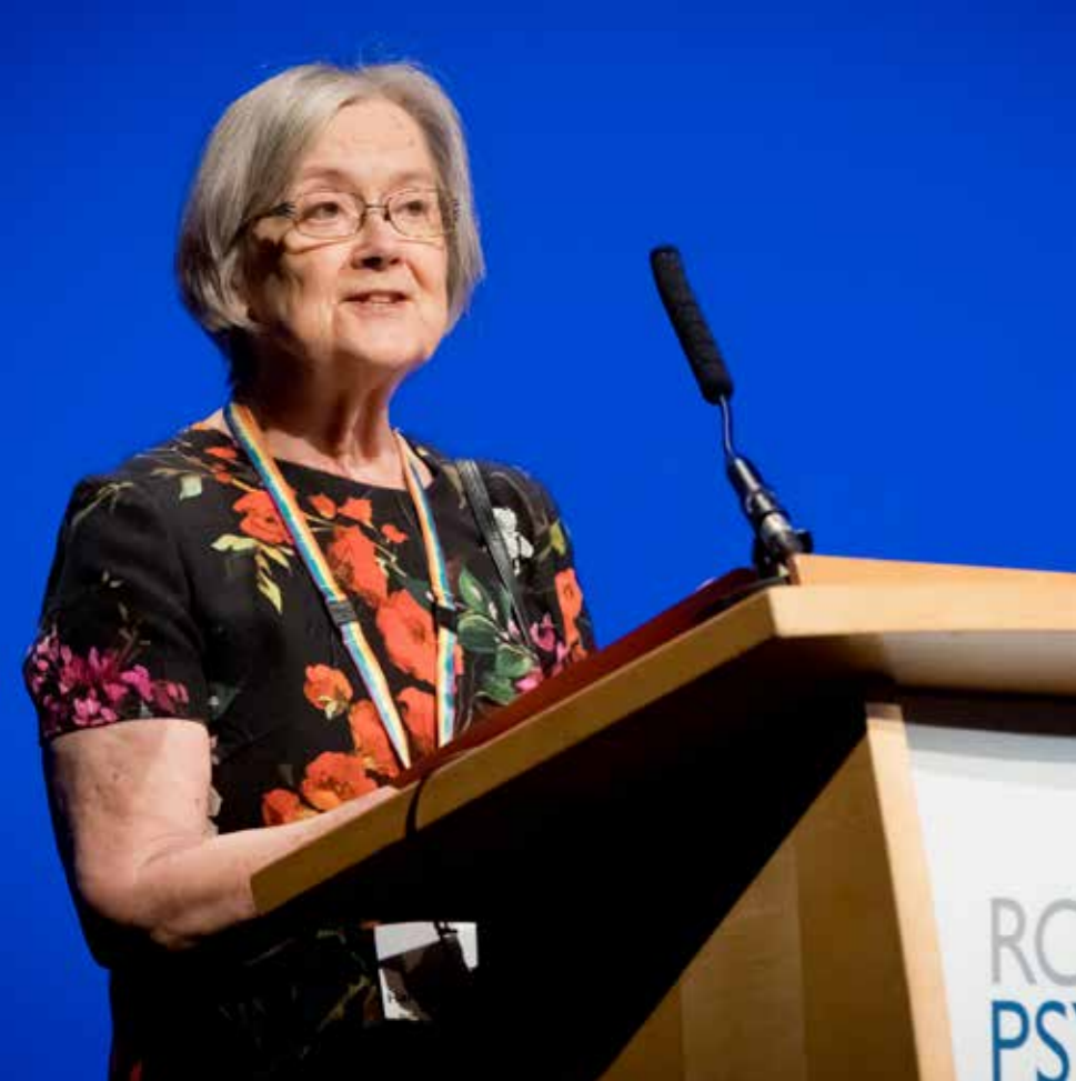
Lady Hale, Supreme Court President, speaking at Congress