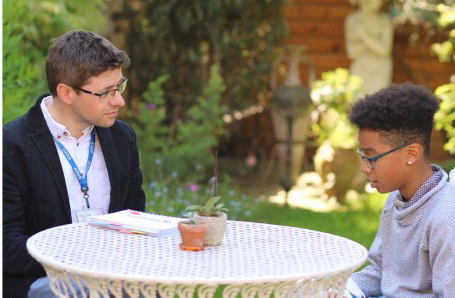
An image from the latest Choose Psychiatry trainee recruitment video

Please send your feedback to magazine@rcpsych.ac.uk or tweet us with hashtag #RCPsychInsight