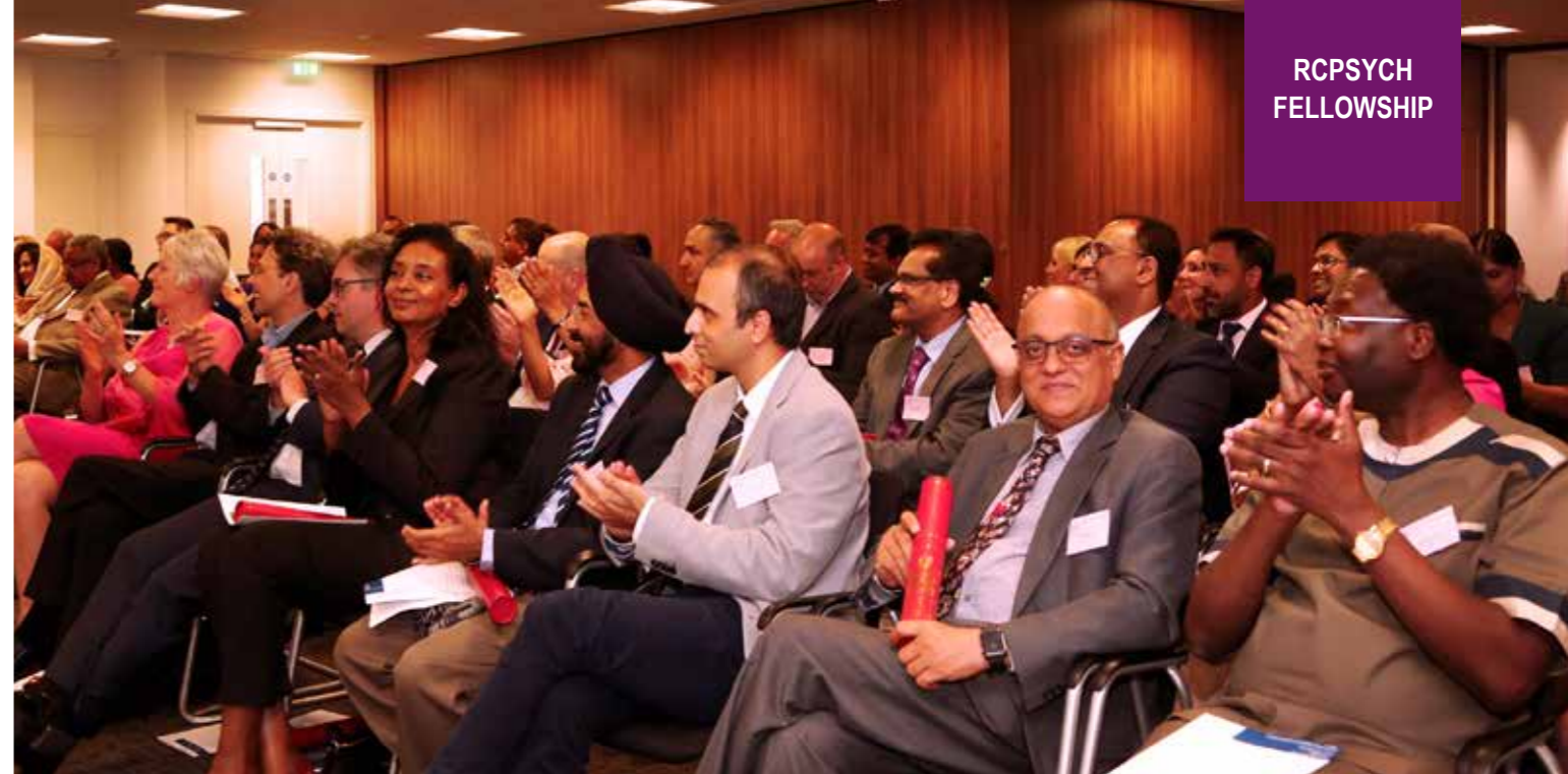
The first Fellowship ceremony to have been held at the College's head office on Prescot Street, London

"Since returning home, I work better in my team – the UK multi-disciplinary approach made me appreciate the role of psychologists and nursing staff. I have more confidence in prescribing certain levels of drugs, having learnt from UK consultants, and I'm more confident about India's new Mental Health Care Act because it's similar to what is followed in the NHS. But the most important thing I took back was the very human approach to mental health, proven in the Mental Capacity Act. The benefits of the MTI are huge and include exposure to subspecialty psychiatry, increased empathy towards psychiatric patients and vastly improved communication skills."