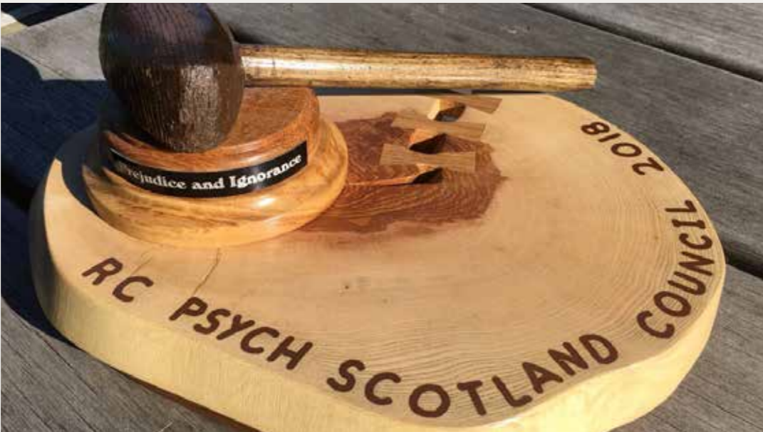
RCPsych in Scotland's commemorative gavel

In a major devolution of power, Scotland, Wales and Northern Ireland will establish their own RCPsych Councils. This follows a recent decision by RCPsych's UK Council and Trustee Board that the College best represents its members when decisions are made by the devolved nations. Having separate and unique devolved governments and healthcare systems means that each devolved nation needs its own robust voice for psychiatry. The Devolved Councils will have more power