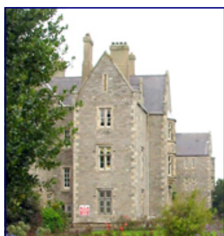
Central Mental Hospital, Dundrum, Dublin