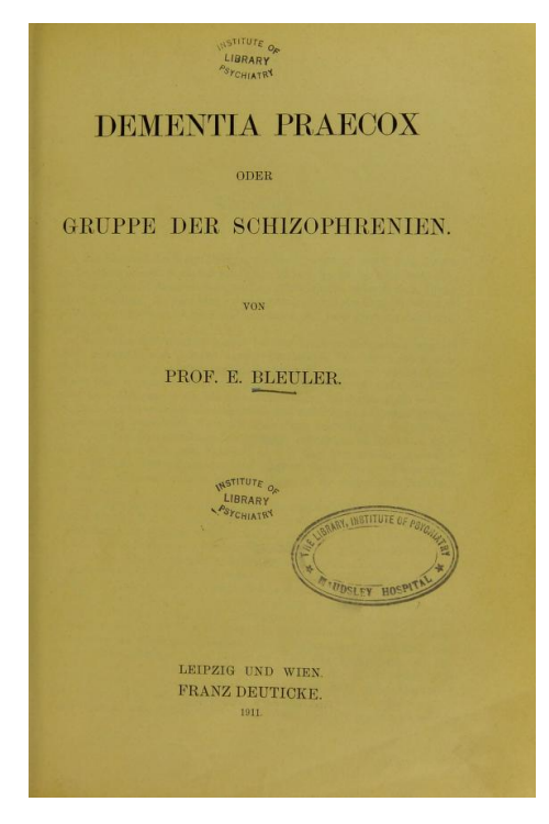
Figure 1: The original 1911 cover of Bleuler's essay (Internet Archive 2015)

Before Bleuler, the name for schizophrenia was continually revised throughout the 19<sup>th</sup> century, as the condition became increasingly well understood from patient accounts (Kyziridis 2005). Falvet's original 'Folie Circulaire' (cyclical madness) in 1851 was followed by Hecker's 'Hebephrenia' (after Hebe, goddess of youth and frivolity) in 1871, and again by Kahlbaum's account of disorders of catatonia and