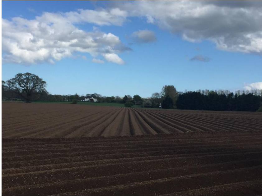
1 Newly ploughed field, Co. Antrim at start of lockdown, March 2020

in our working lives and by the necessary changes in civil liberties we have undertaken to attempt to