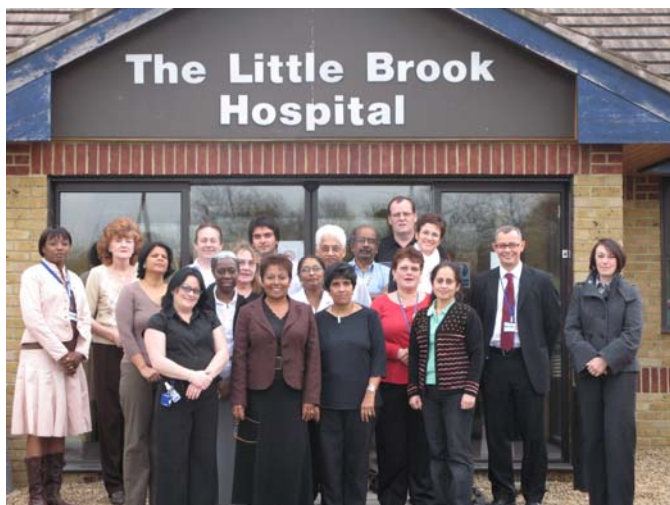
The team at Little Brook Hospital, Dartford, home of Amberwood (formerly Ash) and Woodlands Wards.

"This accreditation is a means of identifying the quality of service provided by the ward and will reassure our patients that they are receiving high levels of care. I congratulate all staff for their role in achieving this award. Excellent changes have been made and they will certainly benefit those who use the services.