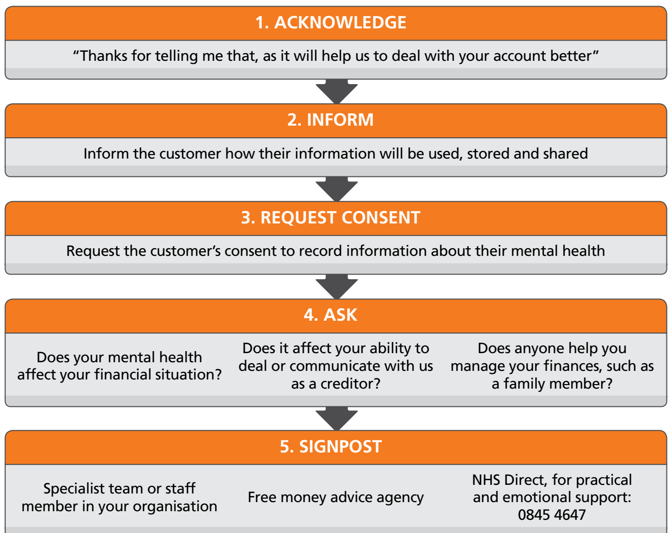
DIAGRAM 1 Dealing with disclosure: a basic drill for frontline staff

Note: Estimated number of employees at small, medium and large call centres based on interviews. Frequencies of disclosure calculated using 30-day month and 12-hour day, based on interviews.