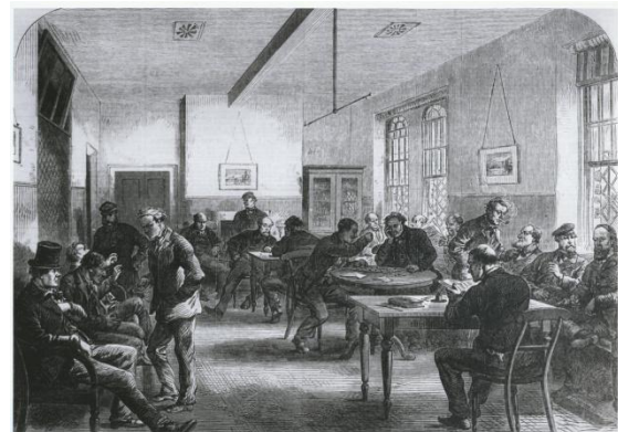
Day room at Broadmoor Hospital (c.1860s)

The name of Broadmoor conjures up an awesome reputation, and in March 2013 the hospital will celebrate its 150th birthday. The Victorian era saw the development of asylums, but in the 21st century most of the old large psychiatric hospitals closed. Yet Broadmoor Hospital has shown its durability, although even it too has been affected, now having less than half the number of patients it held in the 1860s. Since the 1970s, the number of beds in medium secure units has expanded and an admixture of harmony and tension exists between general and forensic psychiatry. Additionally, there is now a forensic interface between the high secure and medium secure units, which is also harmonious in part yet tense in regard to which patients should be in which level of security.