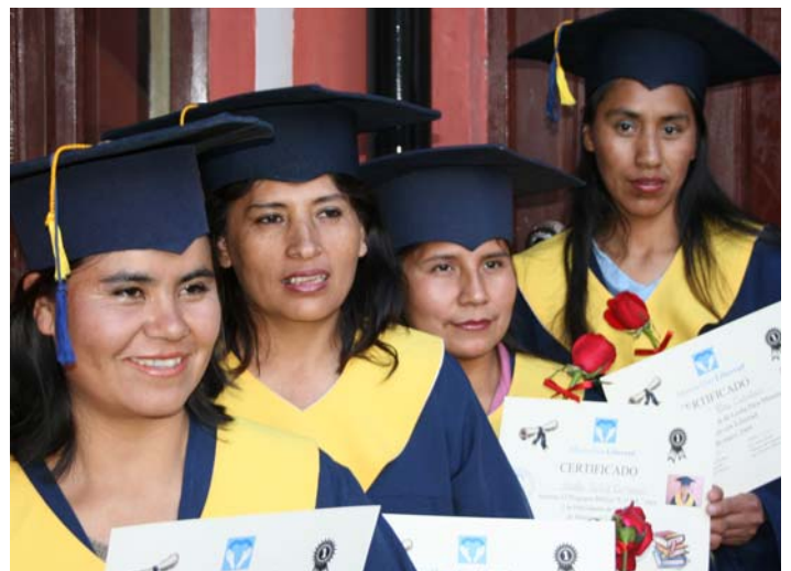
Graduation ceremony for women at FreeHands

A. I thoroughly enjoyed my OOPE and would highly recommend it to anyone who wants to have an exciting experience of psychiatry outside of our usual training. I learnt how to work collaboratively with very limited resources, to identify needs in the system and affirmed my worth as a doctor with a unique set of the skills acquired in my training that I can bring to the MDT in my work. I am ready to face the next challenge!