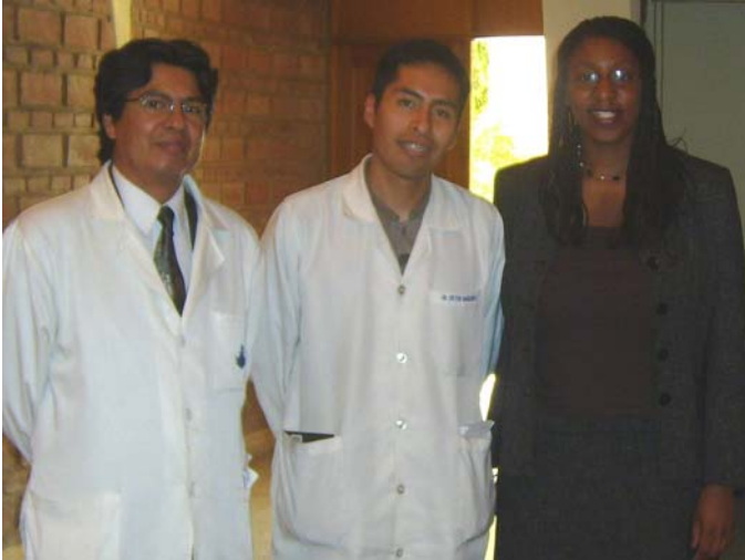
Two Bolivian psychiatrists (in white coats) after one of Anne's presentations