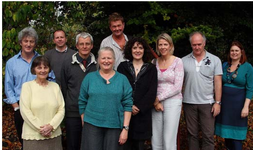
The Wrexham Team

We believe that within public health services, no single profession, brand or model of therapy has any monopoly on meeting these fundamental psychological needs, and that it is the quality of our attachment relationships with our clients that is the single most important aspect of our interventions. Likewise, we cannot offer proper psychological care for our service users – hold them in mind - unless we care for and support our staff.