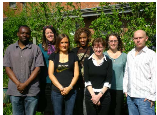
The team of Anxiety UK

Anxiety UK has recently joined the steering group for the national audit of psychological therapies. We felt we had a contribution to make as we frequently receive feedback from our callers about their experiences of accessing therapy through the NHS. We are also lucky enough to share a CEO with Self Help Services, a local Manchester based charity that delivers