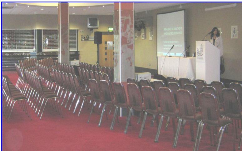
Preparing the room for the delegates arriving.

would prefer that you let us know beforehand and not simply turn up on the day. Please make a note of the end date for registrations, send in your registration form with your remittance in good time to secure your place.