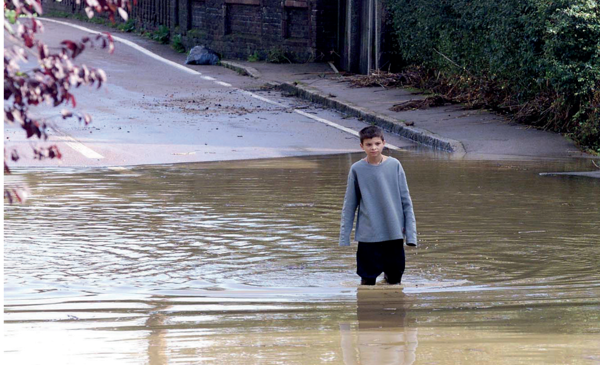
Increased flooding is one of the problems caused by climate change

"Many members are very concerned about the climate and ecological emergency," says Dr Page. "There's a groundswell of opinion that this as an area of debate that the College has a need and right to be articulate on."