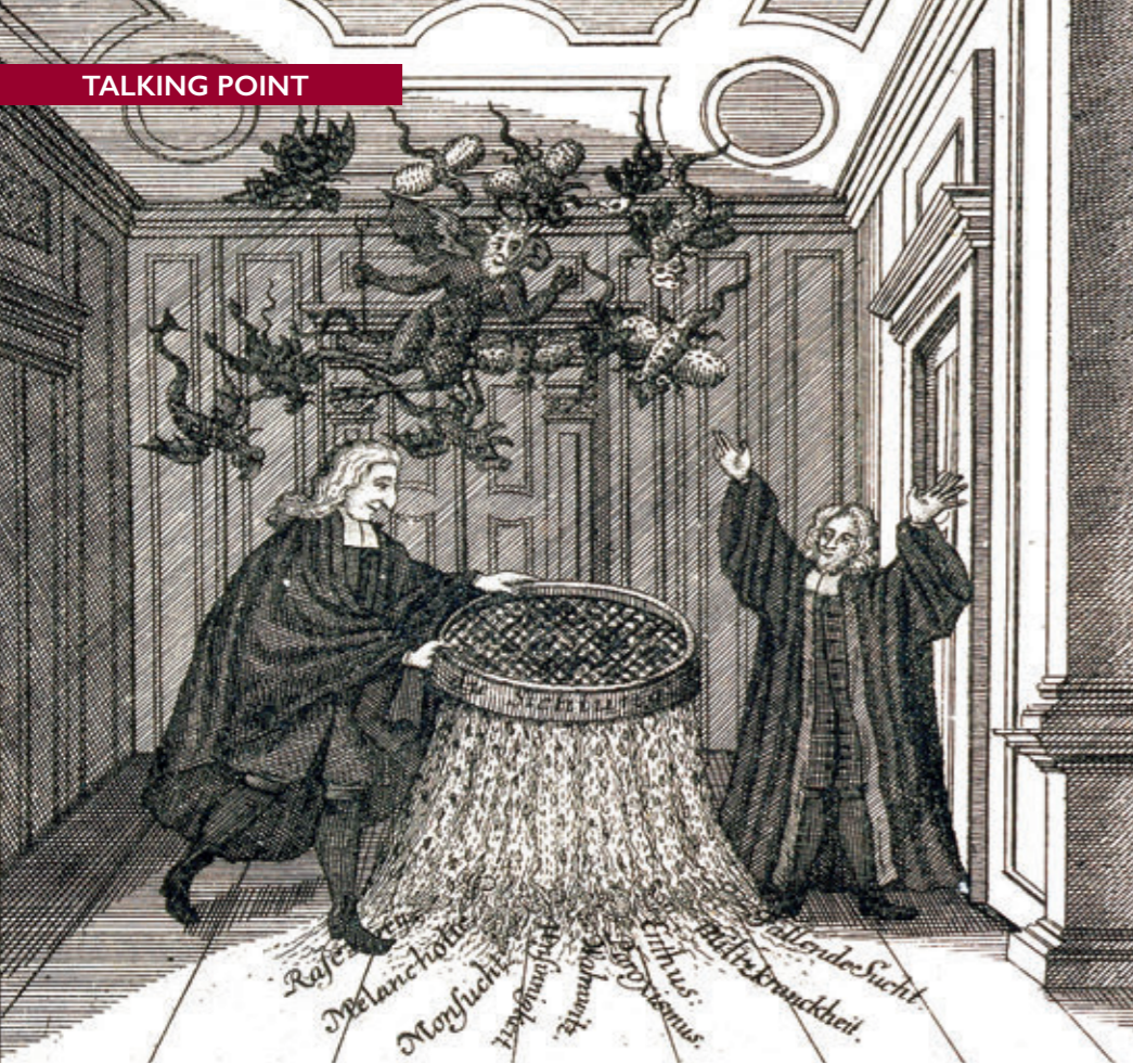
Balthasar Bekker and Christian Scriver sieve diseases from devils.