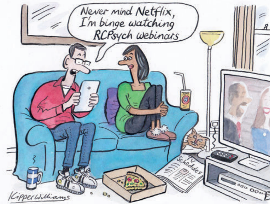
Member engagement with the College's virtual activities has soared in the pandemic. Find out more on pages 10-11.

The programme was the first to take a 'quality improvement' approach on a national scale within mental health services in England to tackle a complex safety issue. A second national collaborative is about to use a similar approach to improve sexual safety on inpatient mental health wards. More information on NCCMH's work can be found at: www.rcpsych.ac.uk/improving-care/nccmh