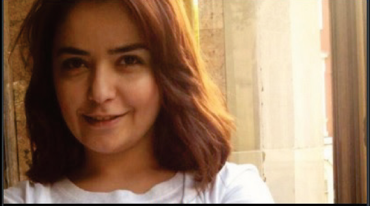
3,953 km from home