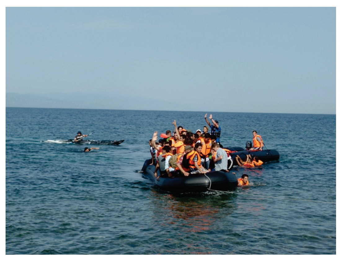
Refugees arriving in Lesvos, Greece.

There are always limits on what we can achieve and this is the basis of humility. Flexibility is important and personal insight. In times of pressure and stress it is important to be open about one's feelings and avoid a stiff upper lip or macho attitudes. This means being prepared to talk about one's feelings and admit the need for help if this is warranted.