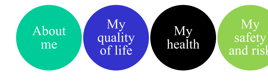
Themes emerging from the analysis

15 patients participated in the in-depth interviews and 48 participants took part in seven focus groups. Thematic analysis yielded six domains, encompassing 42 individual outcome areas.