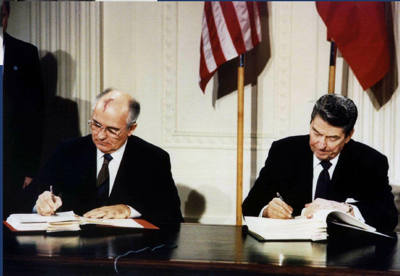
Reagan and Gorbachev sign the Intermediate-Range Nuclear Forces (INF) treaty in the White House, December 1987.