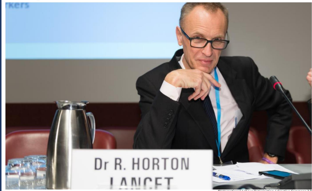
The British Medical Journal has set a global precedent and banned adverts from banks that back fossil fuels.

Brendan Montague | 26th November 2024 | © Creative Commons 4.0