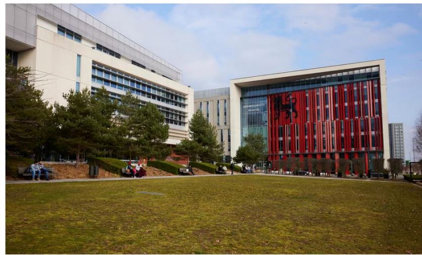
▶ Birmingham City University is one of four institutions to have recently incorporated fossil fuel exclusions into their ethical investment policies.

Move to exclude fossil fuel firms from investment portfolios follows years of campaigning by staff and students