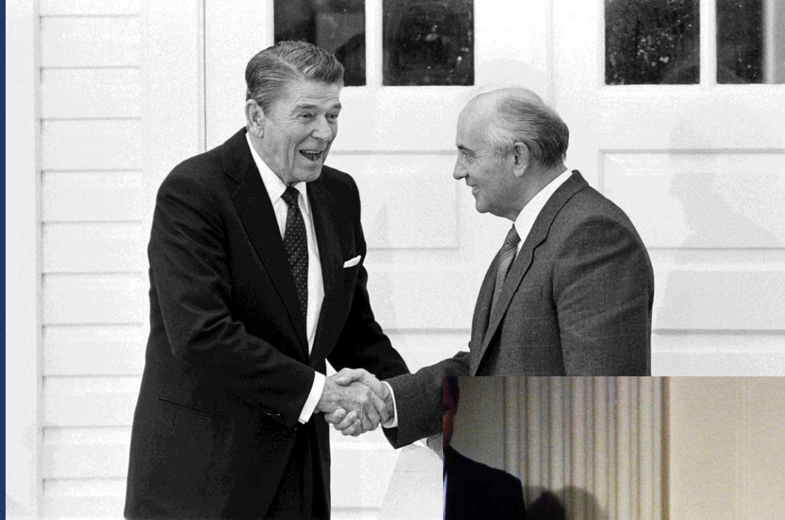
Reagan and Gorbachev shake hands after their mini-summit meeting in Reykjavik, October 1986.