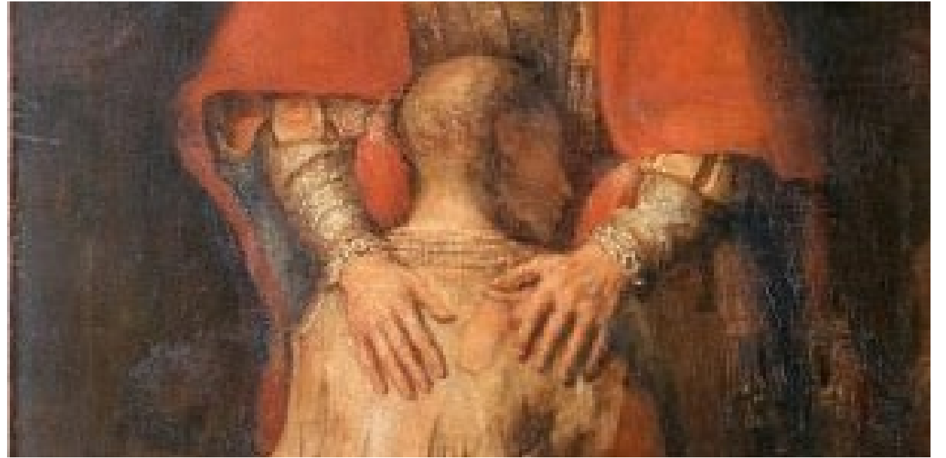
'Return of the prodigal son' Rembrandt