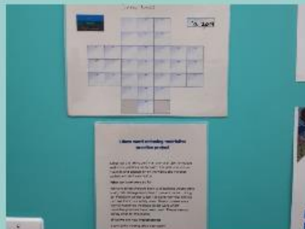
Lilacs Ward SW London & St George's MH FT