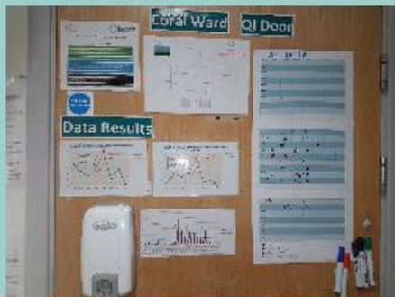
Coral Ward Camden and Islington NHS FT