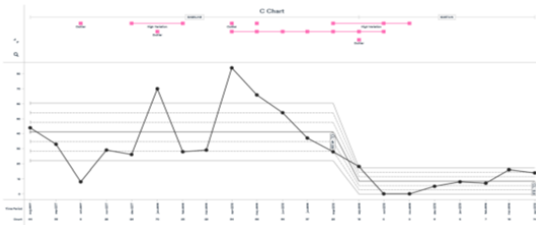
Waveney Ward's Aggregate Data

By now all wards should be testing change ideas, involving service users in the work and putting your data on restrictive practice into LifeQI on a monthly basis. Do reach out if you need any help from us.