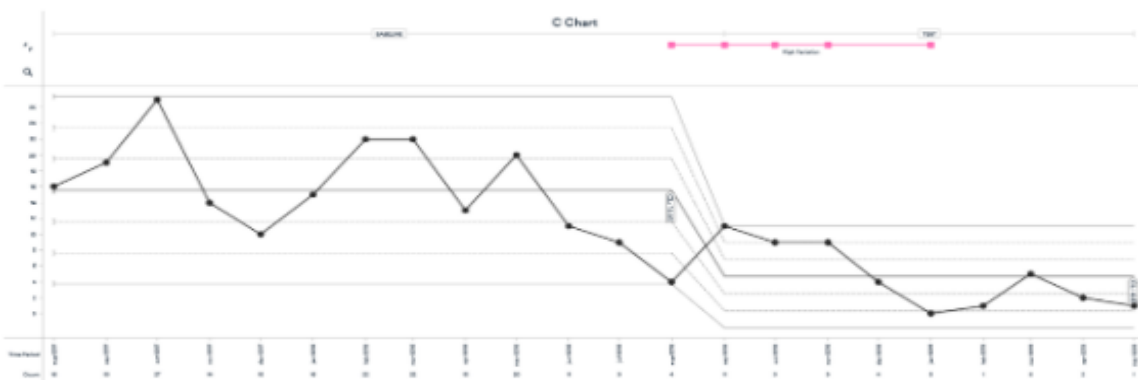
Maplewood 3's Aggregate Data