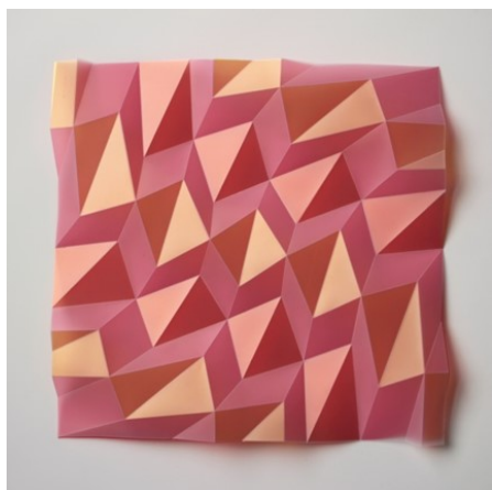
Figure 1: Colour Tile Number 2 by Tony Blackmore, 2020. This is my COVID soul soother. I find mystery in the way it changes with the light. Go on now and discover your own mysteries in life.

I did my personal bit by buying a piece of work from one of my favourite artists in London: Tony Blackmore. If you have never done it, this might be a great opportunity to not only support artists during this time but also to own an original art piece.