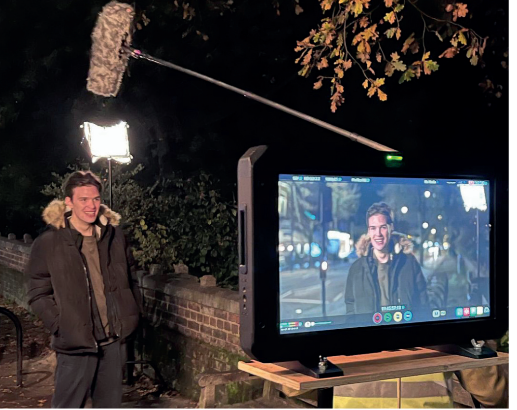
Filming on location for Nexus