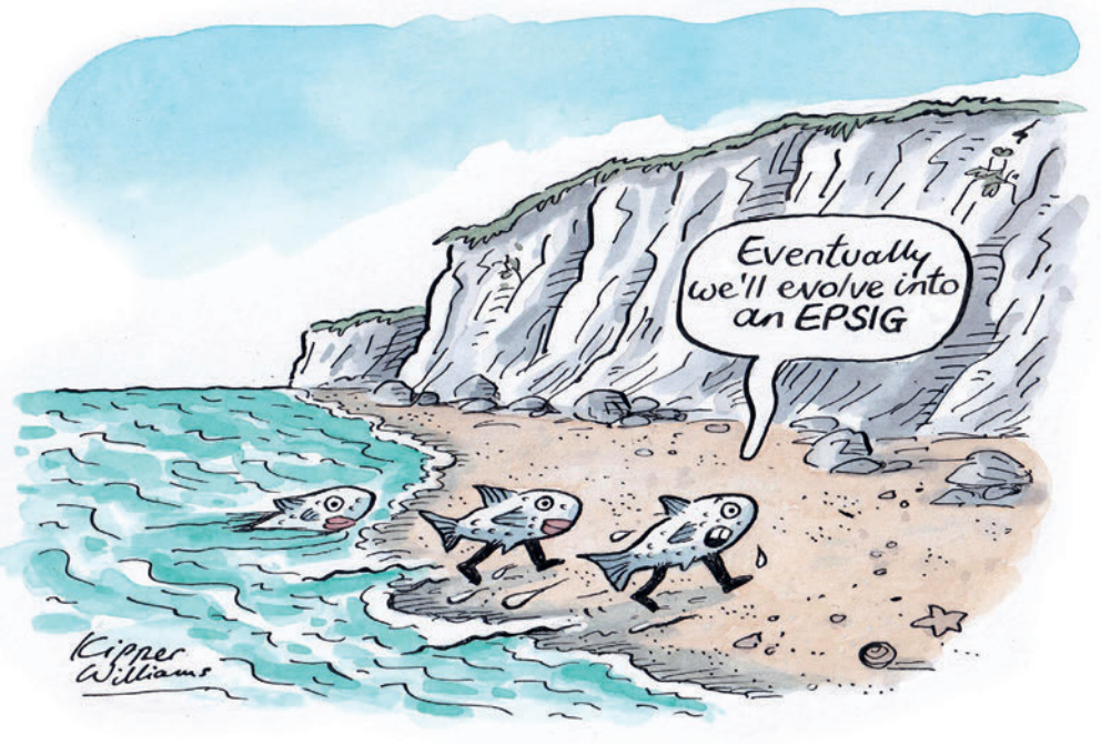
To find out more about EPSIG - the College's Evolutionary Psychiatry Special Interest Group, see page 17.

the goals of the pledge, which our members have also told us are key to challenging sexism in medicine and will be doing all we can to embed these actions alongside our own Equality Action Plan."