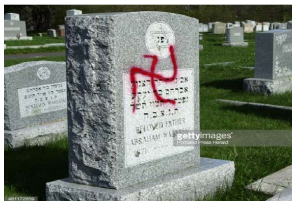
Desecration of Jewish cemeteries: