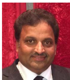
Dhanapal Natarajan Chair