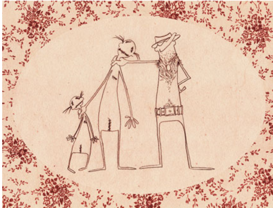
Figure 4: ‘Art against FGM’ by Stella Dreis. 8 The perceived family dynamic in cultures where FGM is practised.

supporter of FGM emphasises that ‘it is good when they cut the woman so that she does not masturbate and does not flirt around’. 13 In this way, FGM is both an act that represses women, and a symbol of their continued repression.