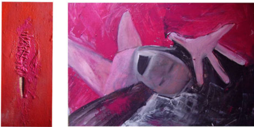
Figure 2: 'Art against FGM' by Conny Niehoff. 8 Circumcision is depicted as a vivid harrowing event.

Many circumcised women find the experience traumatising. This is unsurprising given the nature of FGM: it is carried out using razorblades, knives, glass, sharpened rocks, scissors, burning or fingernails. Anaesthesia or analgesia are usually deemed unnecessary. 5 In interviews with 23 Senegalese circumcised women, all but one described the day of her circumcision as horrifying (Figure 2) and over 80% still had unwanted re-experiences. 6 It is likely that many women develop Post Traumatic Stress Disorder (PTSD), 6 living with a range of symptoms including nightmares, hypervigilance, insomnia, emotional detachment and overpowering emotions. 7