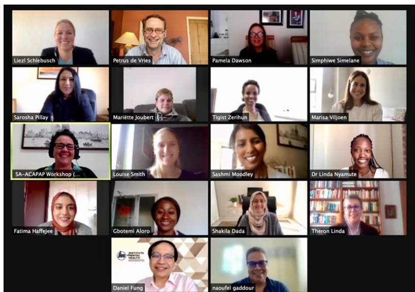
Zoom screen shot of the event