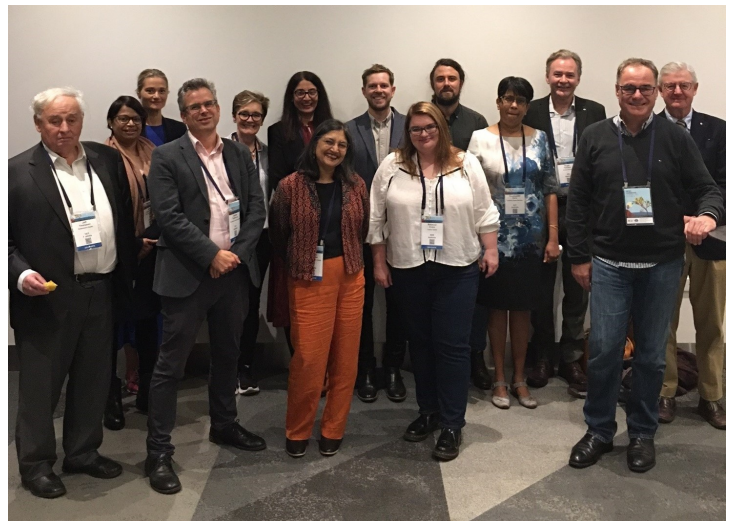
Members at the Western Pacific Division reception, during the Royal Australian and New Zealand College of Psychiatrists in Perth

The West Pacific Division had a get together on Tuesday evening that was attended by about 15 members and fellows of the UK college. This allowed networking and the raising of specific issues mainly around the comparability pathway for UK-trained psychiatrists entering Australian or New Zealand clinical practice.